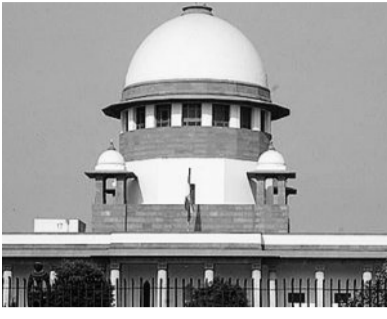
"CAN HEINOUS CRIMES AGAINST WOMEN PERMIT (THE) REMISSION OF THE CONVICTS BY A REDUCTION IN THEIR SENTENCE AND BY GRANTING THEM LIBERTY? THESE ARE THE ISSUES WHICH ARISE IN THESE WRIT PETITIONS" SUPREME COURT