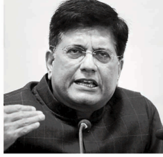
Commerce Minister Piyush Goyal says India is willing to have an 'early harvest trade deal' for 50-100 export products and services

SUBHAYAN CHAKRABORTY New Delhi, 21 July A limited trade pact with the US is only a few phone calls away and will solve the bilateral issues that have accumulated over the past few years, Commerce and Industry Minister Piyush Goyal said on Tuesday. Speaking at the India Ideas Summit, organised by the US India Business Council, Goyal stressed that rather than wait for talks on a full Free Trade Agreement (FTA), India was willing to have an 'early harvest trade deal' that takes into account 50-100 export products and services. 'Early harvest' refers to a trade policy, in which both parties sign off on a set of deliverables. But Goyal also keenly battled for a more comprehensive trade deal as soon as possible. "The US and India need to sit down on the negotiating table. I don't know if that can be done before the elections or post elections, but we need to work towards a more robust and enduring partnership in the form of an FTA, towards which India is willing to work with an open mind," he said. For that, India is willing to open "our hearts and our markets with a corresponding opportunity for Indian businesses in the US", Goyal said. The minister also pitched India as the next manufacturing hub for tech innovations that US companies came up with, providing affordable products for the global market.