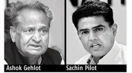
Ashok Gehlot Sachin Pilot

WHAT NEXT ■ CM Ashok Gehlot likely to call a Session to seek vote of confidence ■ If the rebels vote against the Congress, disobeying a party whip, the Speaker can disqualify them ■ If the HC accepts the Speaker's action of disqualifying the rebels, they will not be allowed to vote ■ In this scenario, the Assembly strength will come down, and will help Gehlot ■ If HC terms the Speaker's action wrong, and the rebels are allowed to vote, the government will barely scrape through ■ If governor says the situation is conducive to House-trading, the Centre can place the House under suspended animation